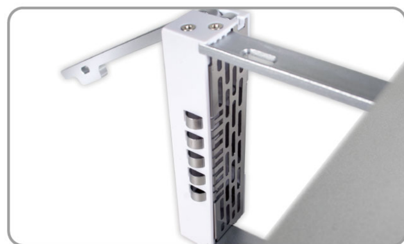
Shock Absorption Drive Tray Design