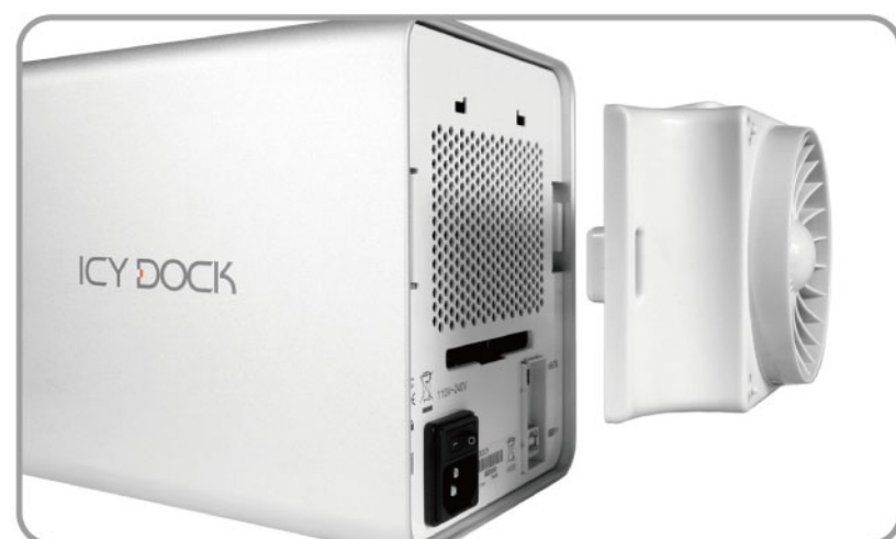
Detachable 80 x 80mm Rear Fan