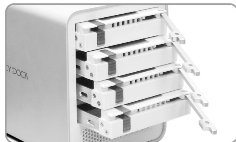
Removable drive tray design